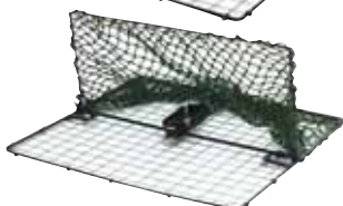
Small Bird trap half activated