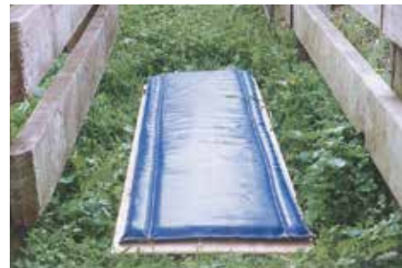
Sheepmat on a plywood base in a sheep yard.

The X-Spurt paddle makes RMT testing a fast and efficient one-hand operation as the 300ml (10fl. oz) X-Spurt reagent reservoir is also the handle for the paddle. Milk is entered in the paddle chambers and the paddle tilted in the normal way to reduce the samples to the usual 3ml (0.1fl.oz). A quick squeeze of the X-Spurt handle then enters equal amounts of reagent at the same time to all four samples. Swirling the paddle mixes the samples for usual coagulation recognition. The bottle capacity is enough to RMT test about 15 cows. The X-Spurt is available in black, blue, or white.