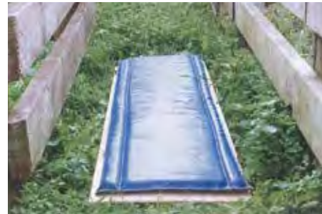
Sheepmat on a plywood base in a sheep yard.

The X-Spurt paddle makes RMT testing a fast and efficient one-hand operation as the 300ml (10fl. oz) X-Spurt reagent reservoir is also the handle for the paddle. Milk is entered in the paddle chambers and the paddle tilted in the normal way to reduce the samples to the usual 3ml (0.1fl.oz). A quick squeeze of the X-Spurt handle then enters equal amounts of reagent at the same time to all four samples. Swirling the paddle mixes the samples for usual coagulation recognition. The bottle capacity is enough to RMT test about 15 cows. The X-Spurt is available in black, blue, or white.